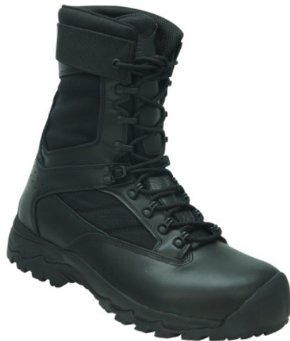
RIP BOOTS #2