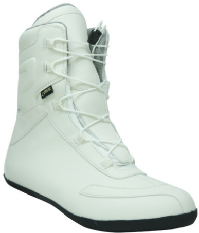
WINTER BOOTS (INNER BOOTS)