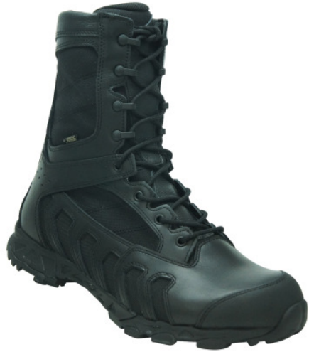
ADT ARMY BOOTS(BLACK)