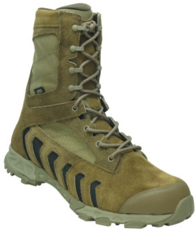
ADT ARMY BOOTS(KHAKI)