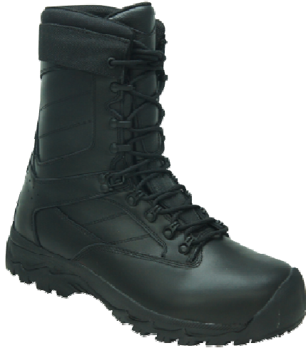
RIP BOOTS #1