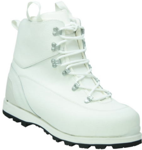
WINTER BOOTS (OUTER BOOTS)